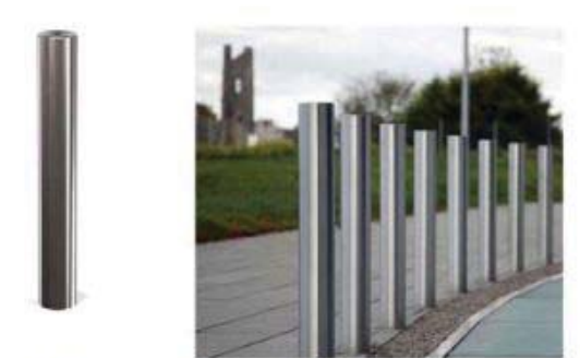
REMOVEABLE BOLLARD S/S WITH CONTRASTING COLOUR BAND S/S SHEFFIELD CYCLE STAND