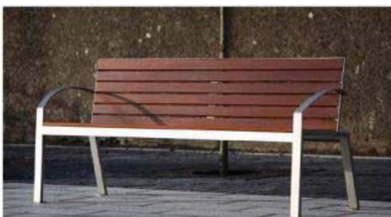
SEAT WITH BACK AND ARM RESTS