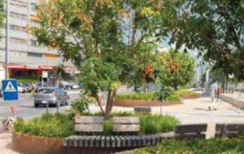
RAISED POWDER COATED ALUMINIUM PLANTER EDGE WITH INTEGRATED SEATING EDGE