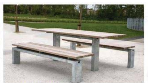
PICNIC TABLE SET